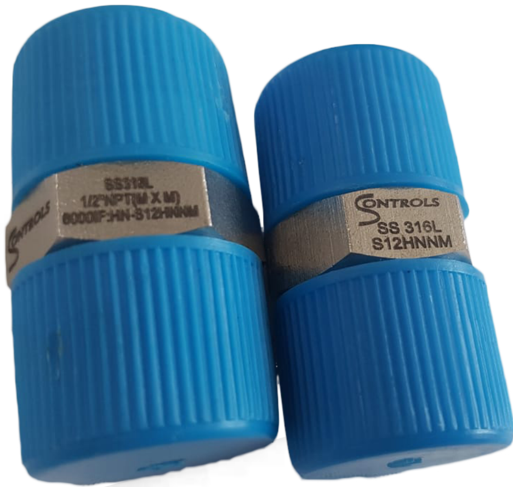
Dimensional Details :