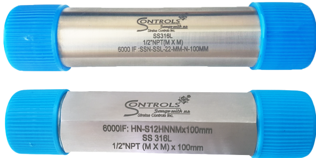
Dimensional Details :